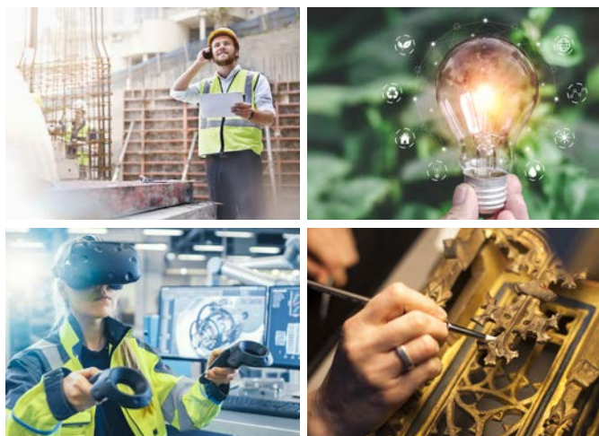
Photos (from top left to bottom right): © Trevor Adeline/KOTO, Aon Khanisorn, Gorodenkoff & Andrei, stock.adobe.com

CoVEs are expected to go far beyond teaching high quality vocational qualifications. Projects must include activities grouped in 3 clusters. Examples of relevant activities are: